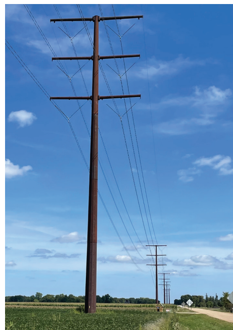
Example of double-circuit 345-kV structure.