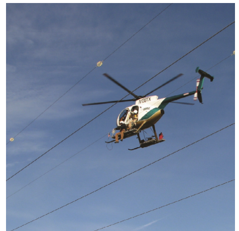
Bird flight diverters

For more information, please visit xcelenergytransmission.com .