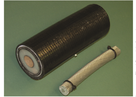
Underground cable and smaller overhead conductor.

Site restoration for underground construction is a much larger endeavor than for overhead construction because soil is disturbed along the entire route. Top-soils must be restored and returned to vegetated areas, and all hard surface areas must be re-established to meet local codes. Vegetated areas may require up to two years to return to preconstruction conditions.