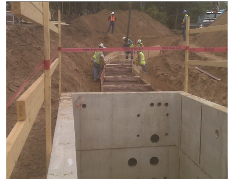
Crews work on an underground duct bank extending from a typical 8'x8'x24' vault

Buried transmission lines have more environmental impacts than those overhead. A 345 kV overhead line typically requires erecting 80 to 150-foot structures and placing the structures approximately every 900 feet. At a minimum, an underground transmission line requires a continuous trench at least three feet wide at the bottom and five feet deep. Considerable clearing and grading would be necessary, and dust and noise from construction would last three to six times longer than they would for overhead construction. Large concrete splice vaults or access structures (see photo) are needed at 2,000- to 2,500-foot intervals. Permanent access to the vaults is required to make repairs when needed.