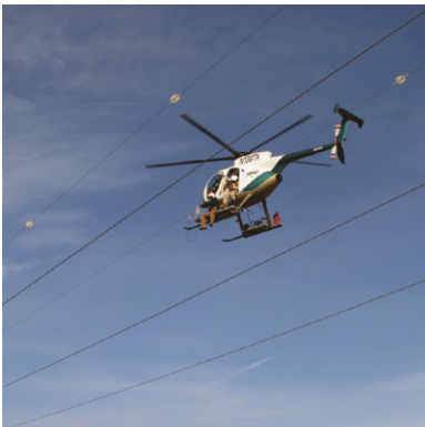
Bird flight diverters