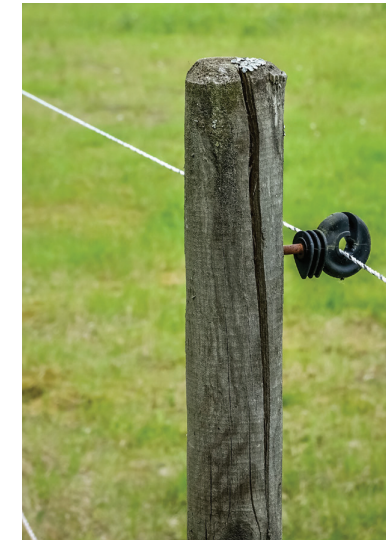
Electric fences are specially insulated from the ground and can pick up an induced charge from transmission lines.