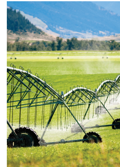
You should never allow a solid stream of water to hit a transmission line wire. Be sure to note the guidelines in this section.